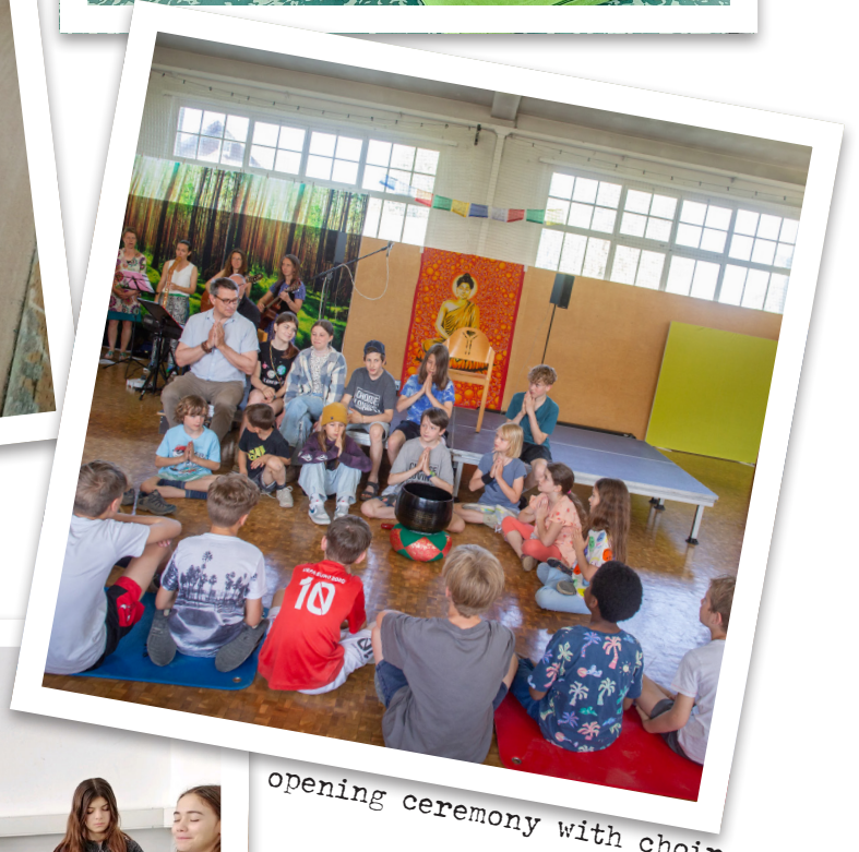
opening ceremony with choir