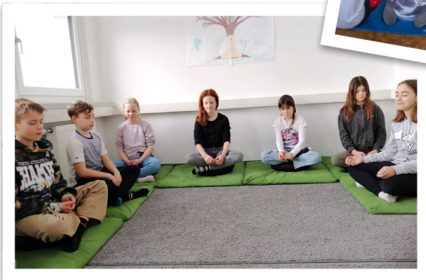
open meditation lesson