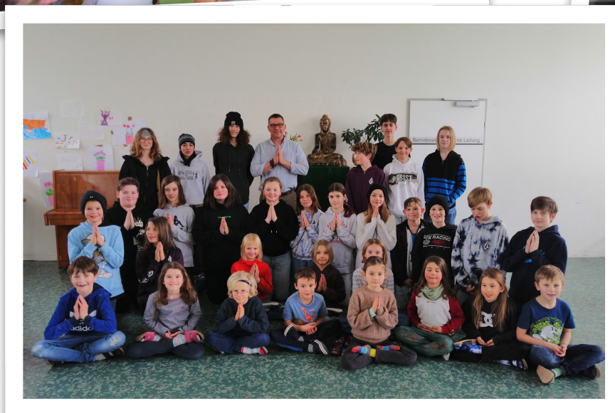
students of BREP with mentor