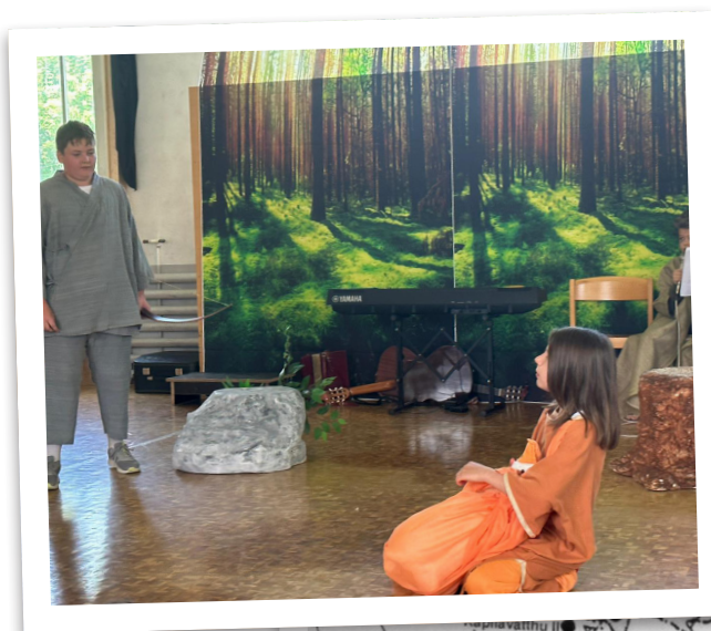
Siddhartha and Devadatta