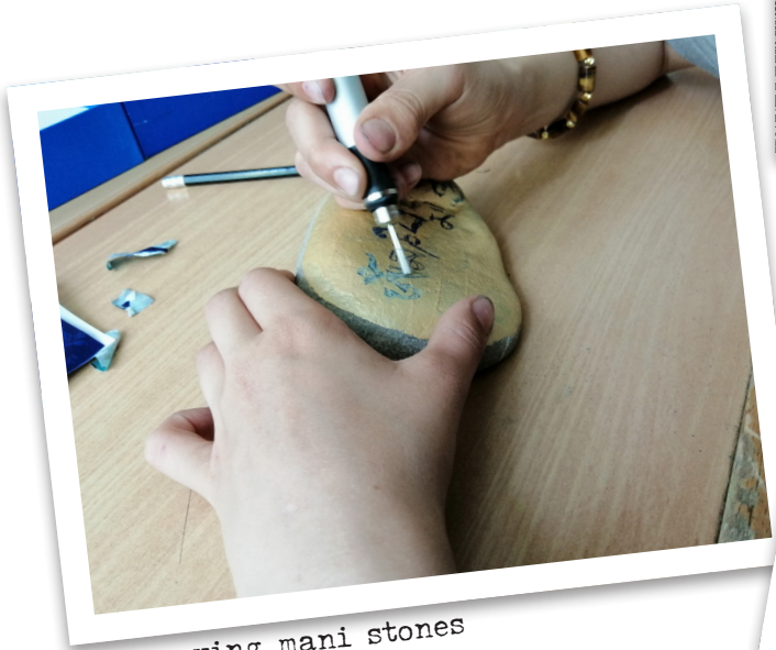
engraving mani stones