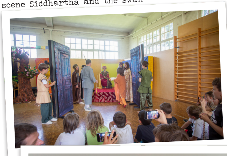
scene Siddhartha and the swan